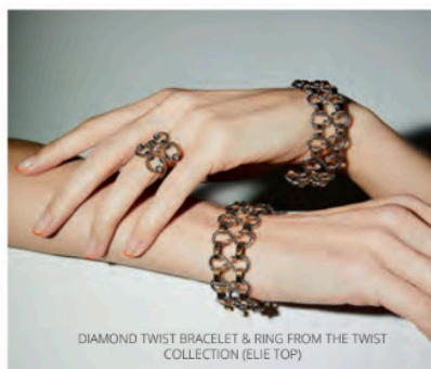
DIAMOND TWIST BRACELET & RING FROM THE TWIST COLLECTION (ELIE TOP)