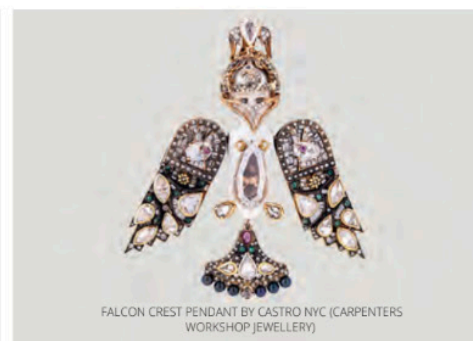
FALCON CREST PENDANT BY CASTRO NYC (CARPENTERS WORKSHOP JEWELLERY)