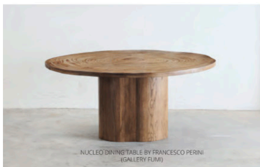
NUCLEO DINING TABLE BY FRANCESCO PERINI (GALLERY FUMI)