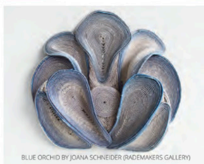
BLUE ORCHID BY JOANA SCHNEIDER (RADEMAKERS GALLERY)