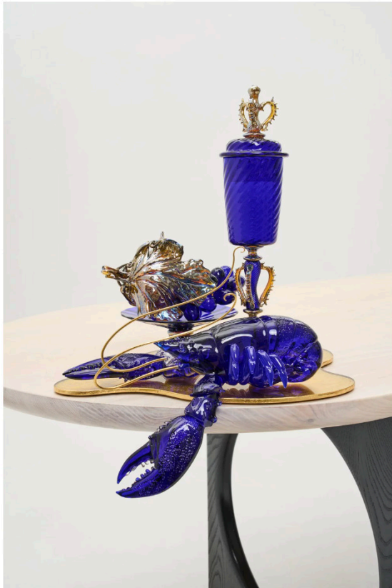
Still Life with Lobster by Elliot Walker. (London Glassblowing/PAD London/Alick Cotterill)