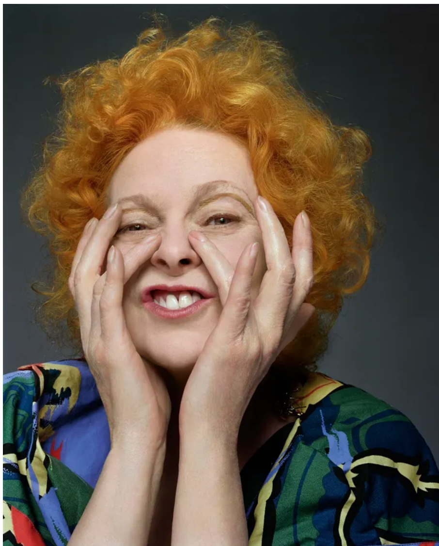
Dame Vivienne Westwood