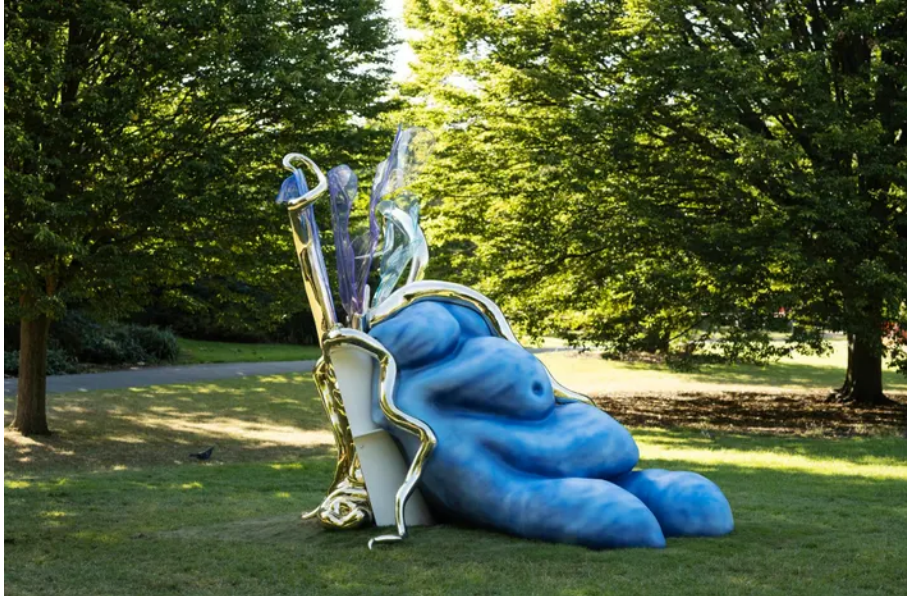
Libby Heaney, Ent - (non - earthly delights), 2024. LIBBY HEANEY, ENT - (NON - EARTHLY DELIGHTS), 2024.