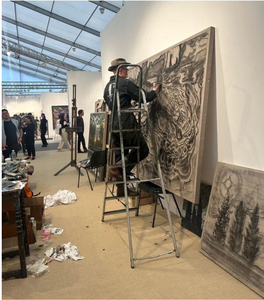
Billy Childish painting live at the Lehmann Maupin booth at Frieze London.