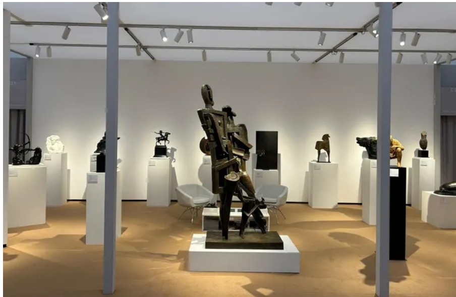
Bowman Sculpture at Frieze Masters.